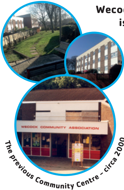
The previous Community Centre - circa 2000

The housing development of Wecock Farm, which was built on part of the Woodcroft Farm, was started in 1975 by Portsmouth City Council to meet the needs of the ever increasing population.